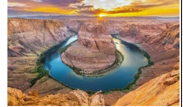
Utah and Arizona: April 23 – 30, 2020

Enjoy a winery visit, five UNESCO World Heritage Sites, and a cork factory tour. Learn more about this trip to Portugal.