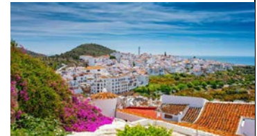
Andalucía, Spain and Portugal: October 14 – 28, 2020