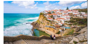
Portugal: August 25 – September 3, 2020