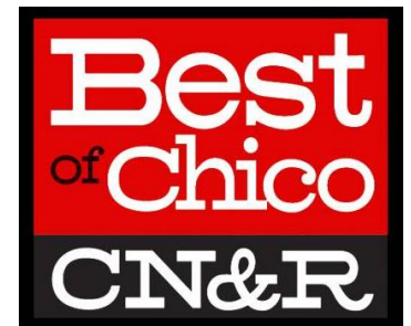
Altum Wealth Advisors voted #1 in 2019 Chico News & Review public poll!