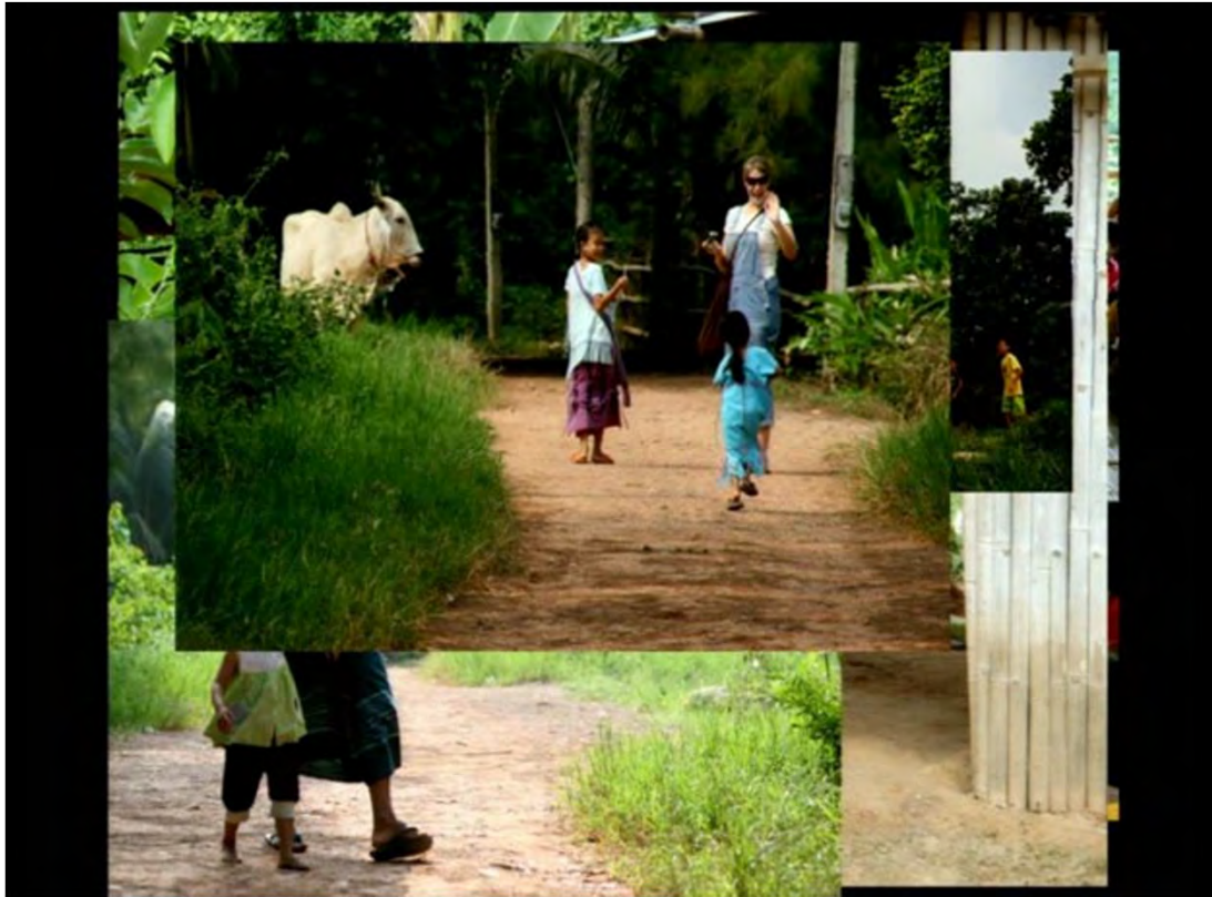
And the cows.