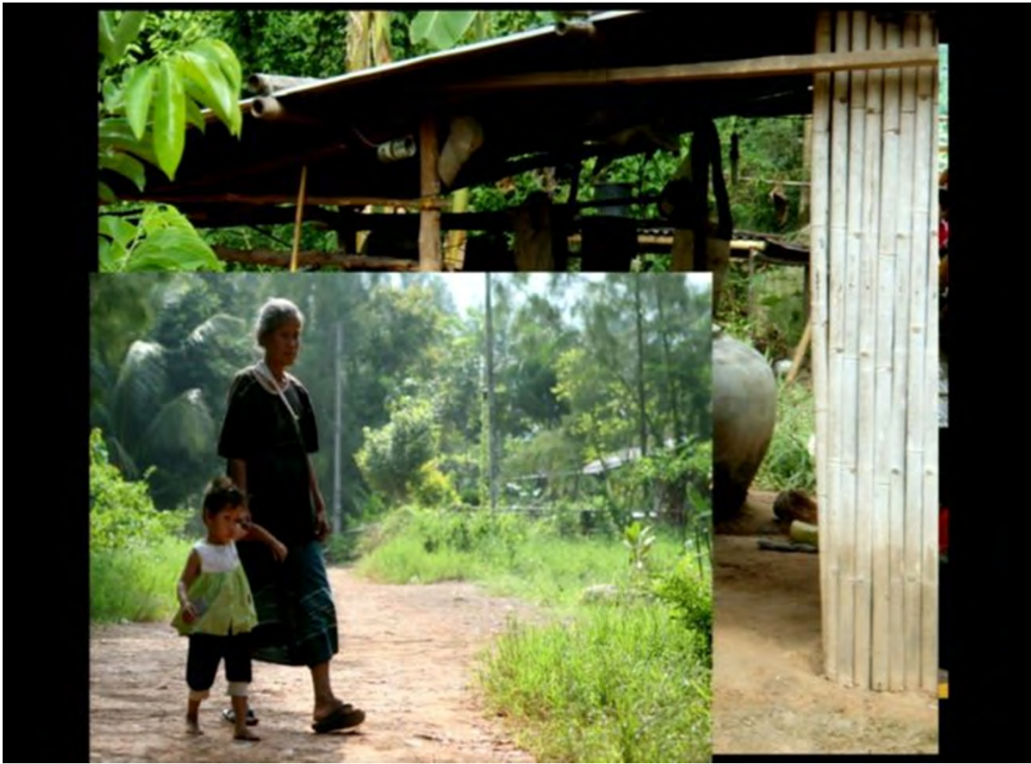
This is a great grandmother and her granddaughter.