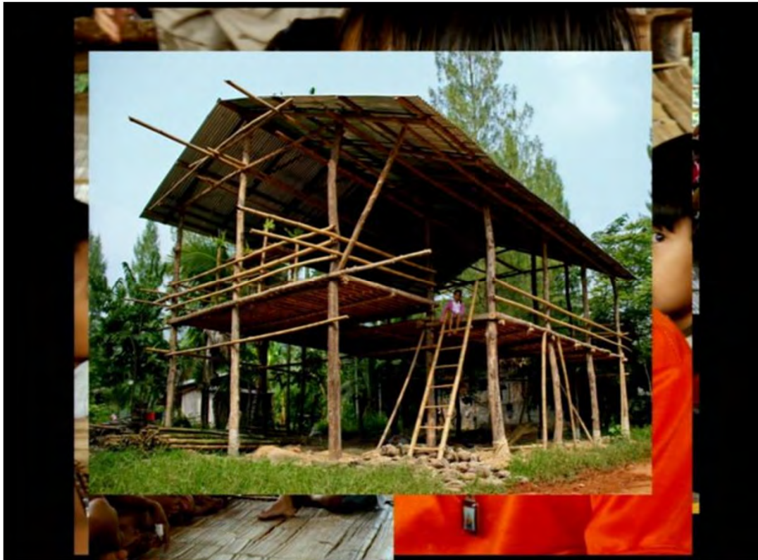
This is an example of one of the homes in the village.