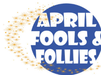
Downtown Chico April 11-14

Tickets are $10. Purchasing info coming soon!