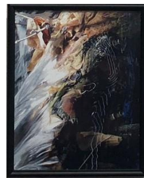
The Weir Carolyn McLeod

OLLI photos in Bradley 1 are for sale! Interested? Contact the OLLI office at (530) 898-6679. Look for more photographs each term as Dick's students continue to prep their work for exhibition!