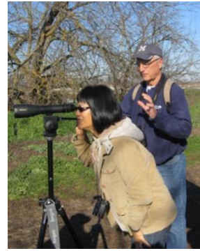
Birding never gets old! Check out this photo from 2010

Check out our Peer Leader Resources page to find out the many ways we support our volunteer instructors. Once there, scroll down to the links for Summer '19 and Fall '19 course proposal submissions. The online forms provide the information we need to enter your class into the schedule matrices.